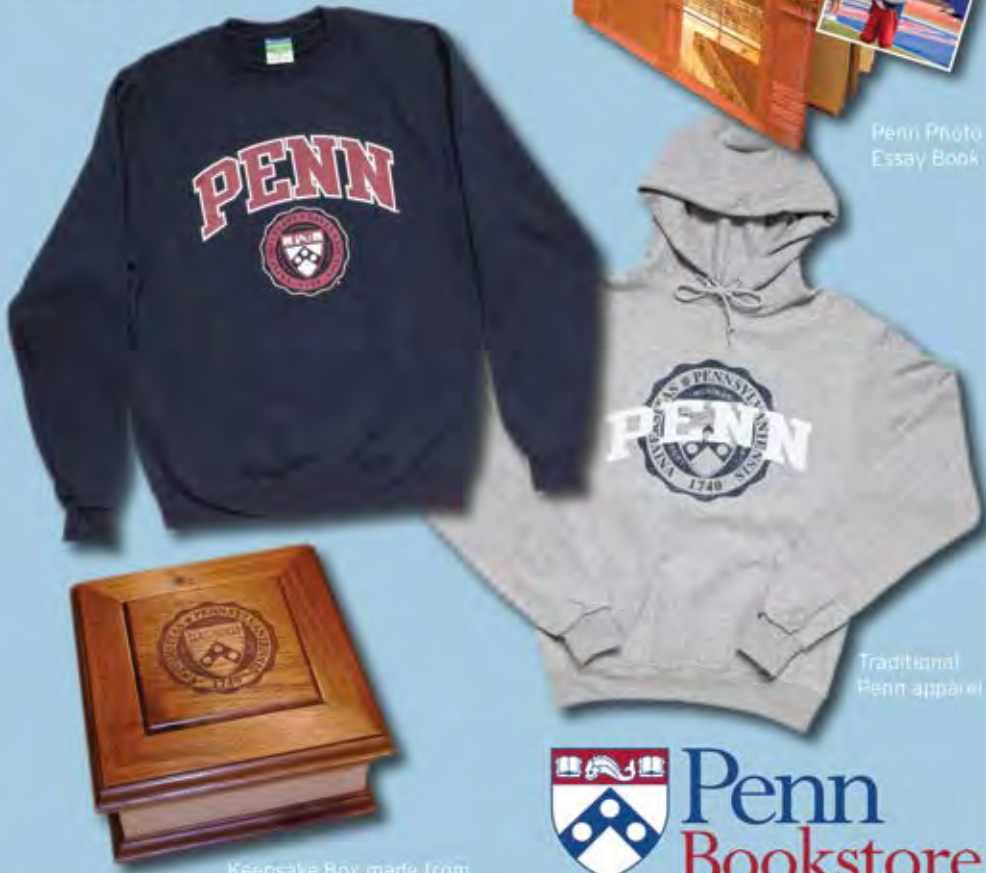
Penn Photo Essay Book

Treat yourself to a Starbucks® coffee and tasty, healthy snacks in our wireless café!